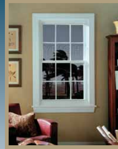
In the event of violent weather, you don't need to do anything with your windows other than to ensure that they're closed and locked.

The All Stormgate products undergo rigorous testing to ensure dependable performance under the most extreme conditions.