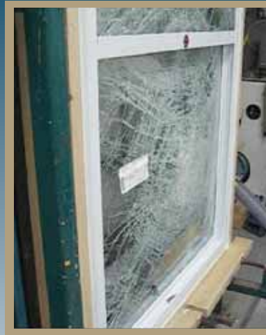
Impacted windows are tested with hurricane-force winds after taking a direct hit from a 9-lb. 2x4, flying at 54 mph.