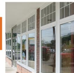
Storefront & Curtain Wall

Stergis is a single-source manufacturer for Heavy commercial and AW rated aluminum single & double hung windows. These high-performance architectural windows meet, or exceed, all air, water, and structural load requirements set forth in AAMA/NWDA 101/I.S.2 - 97 for Commercial Grades. The top and bottom sash tilt design offers lower cost cleaning and maintenance. All windows are made to any size required.