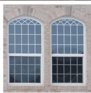
Tilt Single & Double Hung

Visit us on the web at: www.stergis.com where you'll find a large assortment of window construction details, performance test results, and more—including our full line of PVC window products. Whatever your next building project is, contact us for a complete window analysis and a competitive price bid.