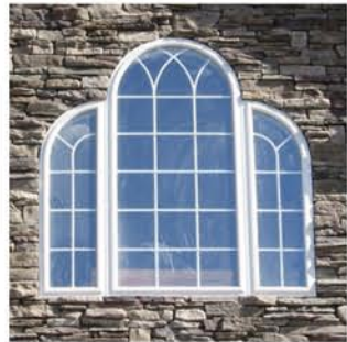
Fixed & Sliding Windows